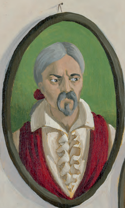
Doctor Alexandre Manette